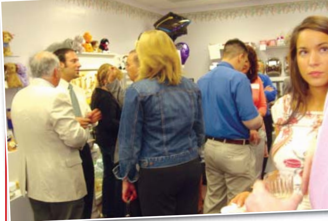
Guests networked while enjoying delicious Italian favorites and sweet candy creations!