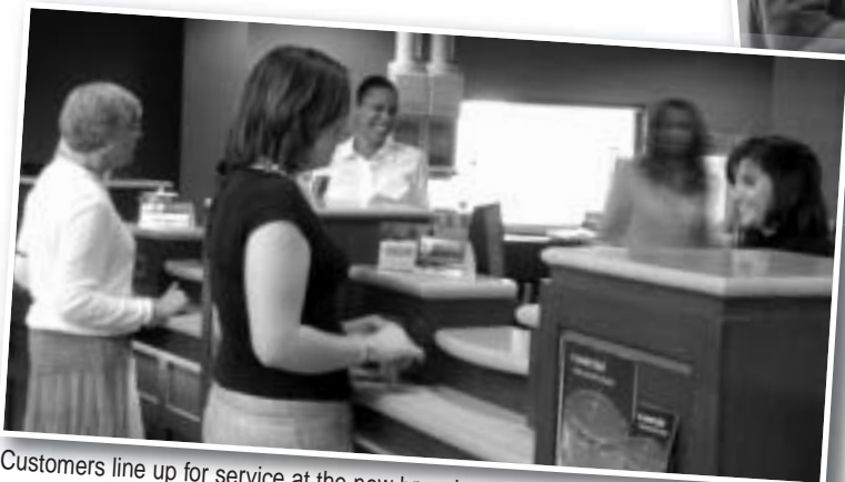
Customers line up for service at the new branch.