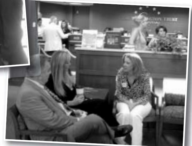
Washington Trust Employees enjoy the elegant waiting area in the new branch.